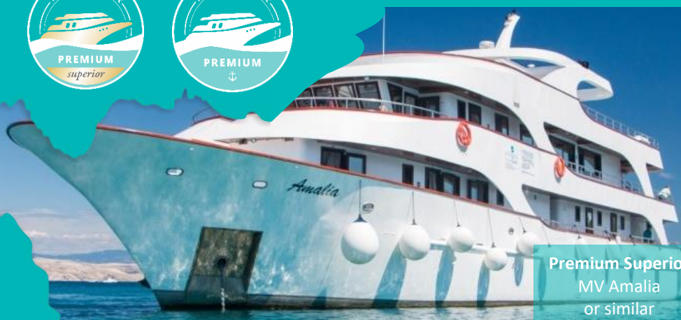
Premium Superior MV Amalia or similar