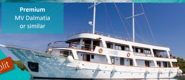
Premium MV Dalmatia or similar