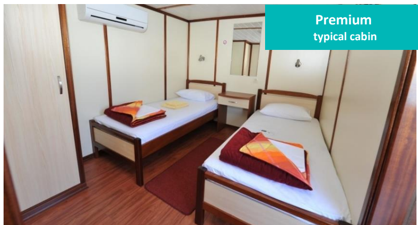
Premium typical cabin

Legend: B – breakfast, L – lunch, CD - Captain's dinner