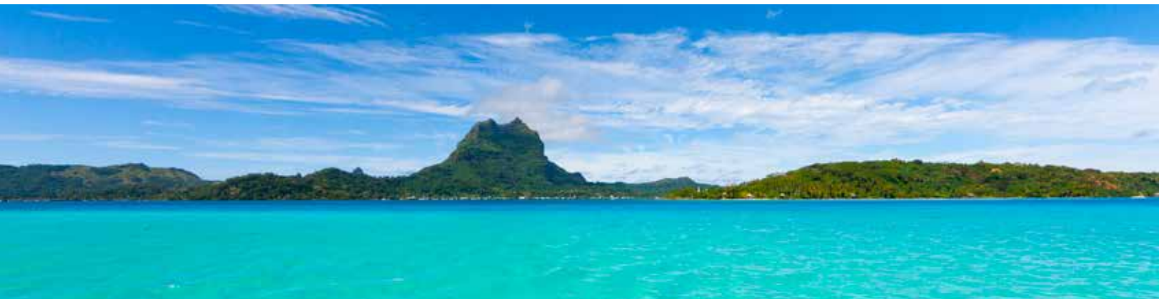
Photos, top to bottom, left to right: Page 12: Light house, Fakarava; Beach and lagoon, Rangiroa; Island of Bora Bora.

In this picture perfect island paradise, you will enjoy a day at the beach on a private motu while the crew prepares another delicious picnic lunch featuring Tahitian specialties. In the afternoon, you will have time at your leisure. You may also choose from a variety of optional excursions at an additional cost, such as a circle island tour by boat or bus, or one of the most popular, shark and ray feeding.