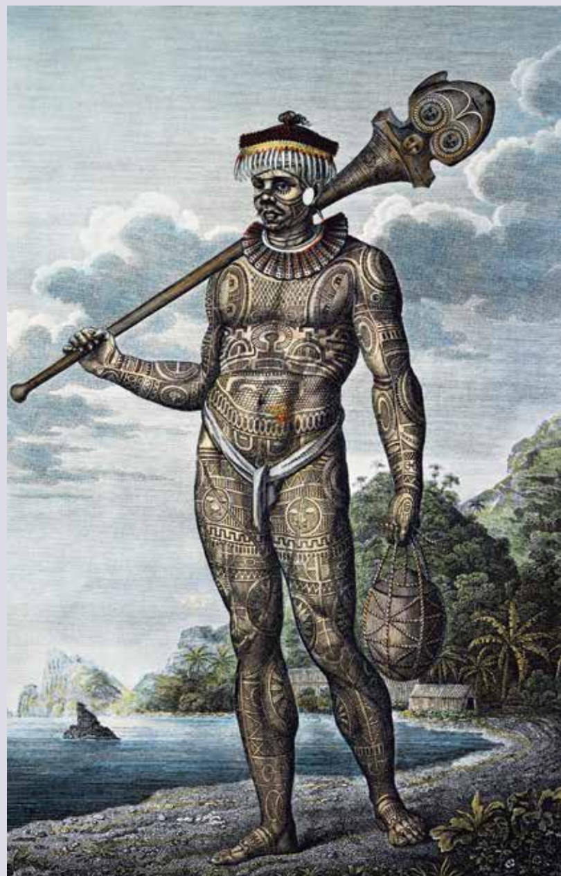
Tattooed Man from Nuka Hiva, Wilhelm Gottlieb Tilesius von Tilenau, in Krusenstern, A. J. von, Voyage Round the World in the years 1803, 1804, 1805, & 1806 . . . Richard Belgrave Hoppner (trans.), J. Murray, 1813, Atlas: plate 10.

The modern word tattoo originates from “tatau” in early Polynesian history. Practiced throughout all the island groups, the Marquesan designs represent gods, mythology and nature. In tradition, tattooing began shortly after birth and continued to mark rites of passage. A Marquesan man’s status could be read from his tattoos. Men were generally heavily covered, with women tattooed on the hands, arms, lower body and behind the ear. Banned by the French from 1858 until 1985, it is flourishing and influencing the art worldwide.