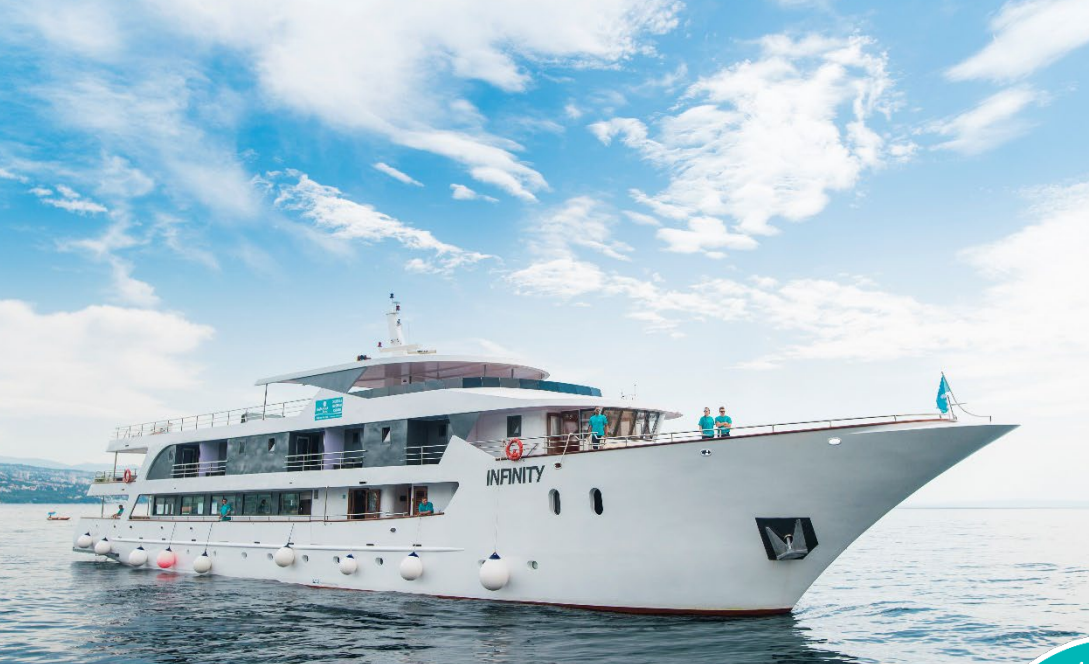
MV INFINITY or similar