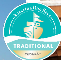
MV KALIPSA or similar