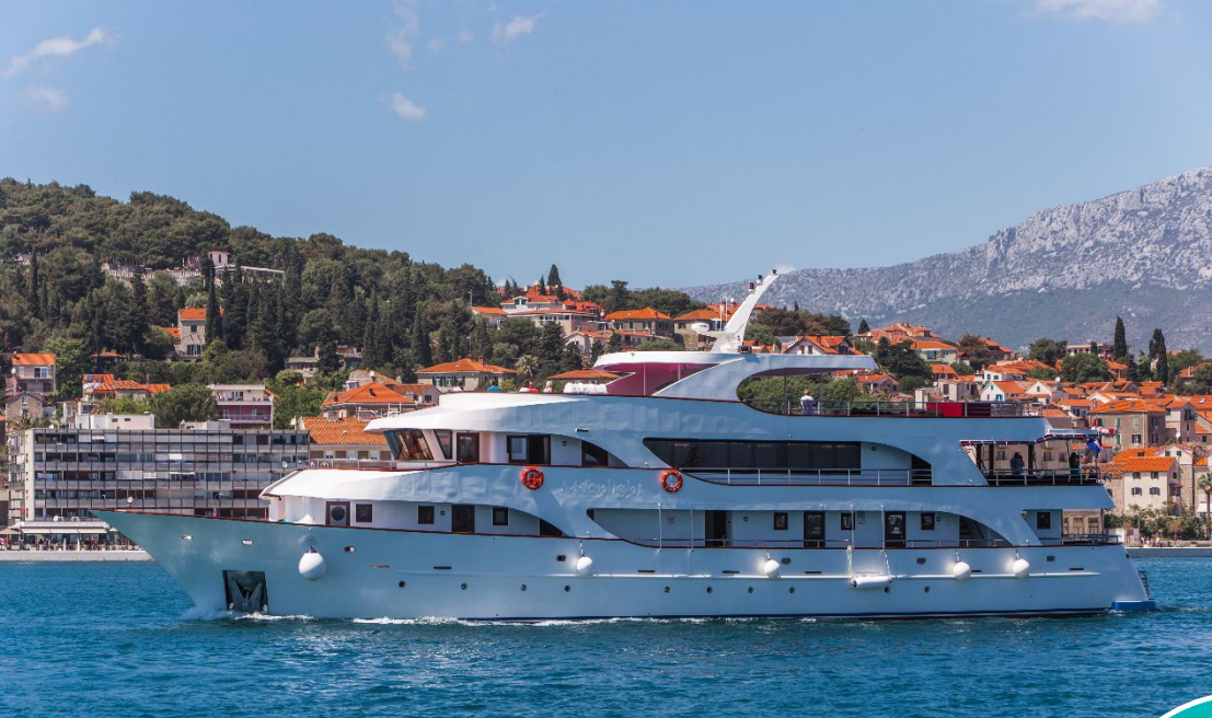
MV MOONLIGHT or similar