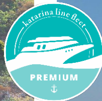
MV ANTONELA or similar