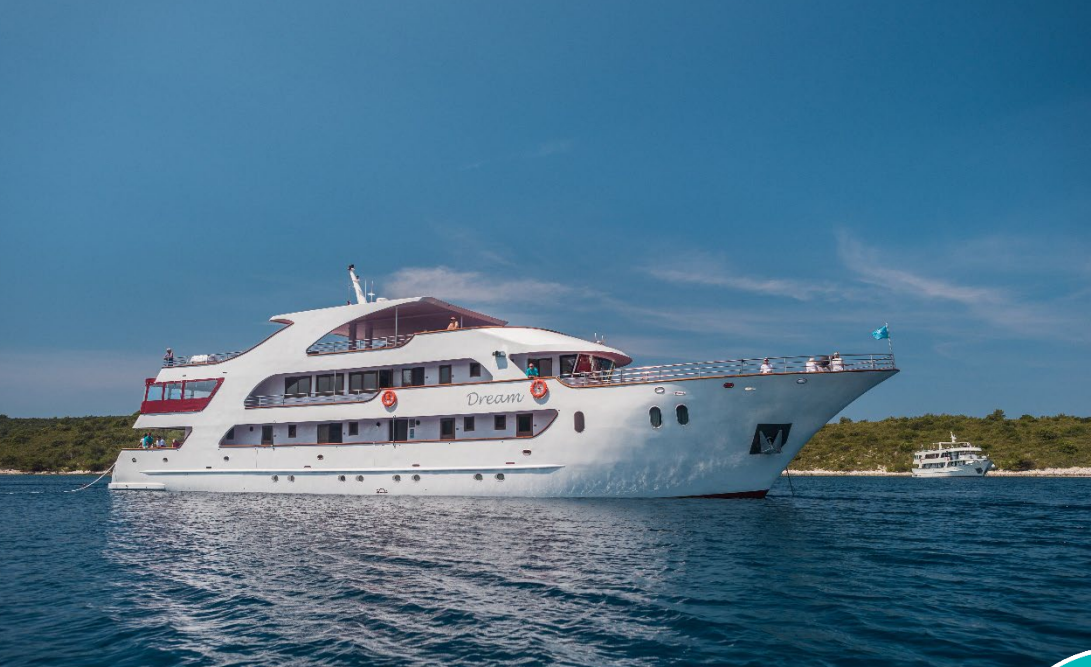
MV DREAM or similar