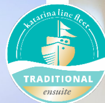
MV ANTONELA or similar