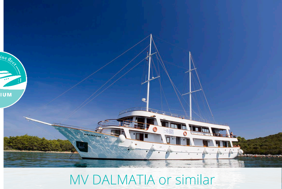
MV DALMATIA or similar